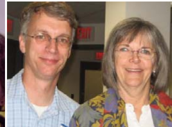
EMBA 99er SECTIONAL PAIRS WINNERS