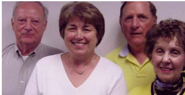
EMBA 99er SECTIONAL TEAM WINNERS